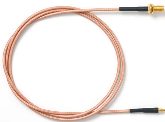
Model 73065 MMCX Plug to SMA Bulkhead Jack, RG316/U

Small size, and durability for confident connections