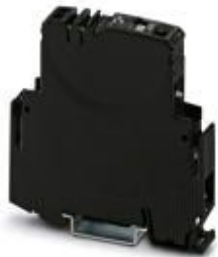
Electronic circuit breaker, signal contact: 1 N/C contact, nominal current: 4 A

Please be informed that the data shown in this PDF Document is generated from our Online Catalog. Please find the complete data in the user's documentation. Our General Terms of Use for Downloads are valid ( http://phoenixcontact.com/download )