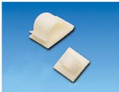
Adhesive clips come in pairs connected together on adhesive liner.