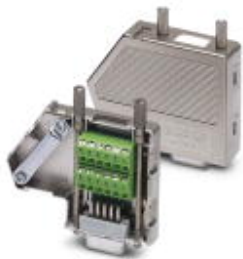
D-SUB connector, 9-pos., male connector, two cable entries < 35°, universal type for all systems, pin assignment: 1, 2, 3, 4, 5, 6, 7, 8, 9 to one screw connection terminal block

Please be informed that the data shown in this PDF Document is generated from our Online Catalog. Please find the complete data in the user's documentation. Our General Terms of Use for Downloads are valid ( http://download.phoenixcontact.com )