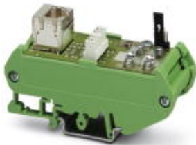
Patch panel for PROFINET, RJ45, DIN rail mounting, IP20, 8 slots, IDC connection, CAT5e, option of shielding via jumpers

Please be informed that the data shown in this PDF Document is generated from our Online Catalog. Please find the complete data in the user's documentation. Our General Terms of Use for Downloads are valid ( http://phoenixcontact.com/download )