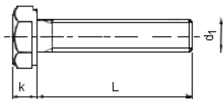
DIN 933/ISO 4017