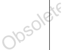
Figure 1. STEVAL-IFS009V1 extension board schematic