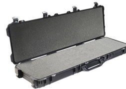
1750WF With Foam