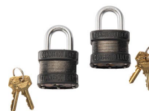
PL2 Padlock (2 pack)