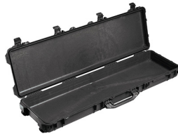
1750NF No Foam