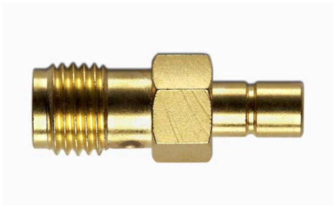
Model 72978 SMA (F) TO SMB (M)