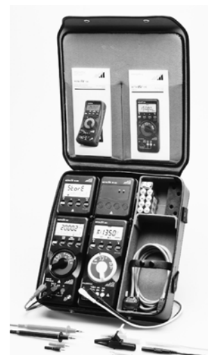
F840 (with sample contents)