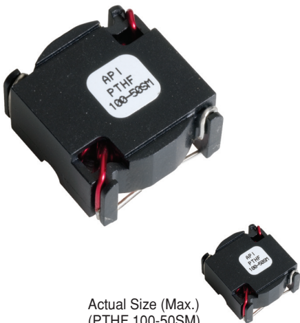
Actual Size (Max.) (PTHF 100-50SM)