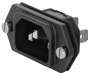
6100 with sealing to appliance