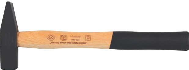
Engineer's hammers - German pattern