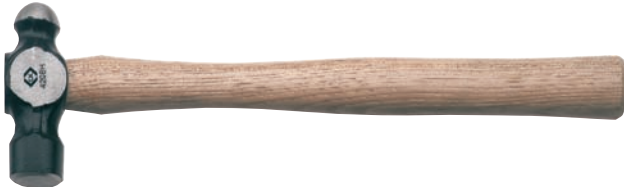
Ball pein hammers