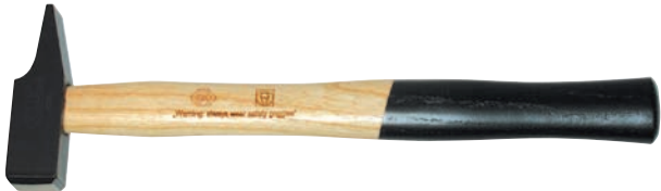
Engineer's hammer - French pattern