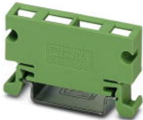
The illustration shows product UM 45-SEFE

Side element with foot, however without PCB guide, labeling with SS-ZB, mounted along the length of the DIN rail NS 35/7.5. Height: 36 mm, width: 10 mm, length: 45 mm.