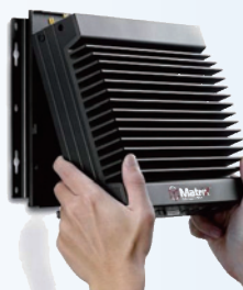
1. Ready-to-deploy wall mount kit