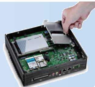
3. Flexible memory expansion slots