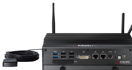
MXE-5300 with Antenna