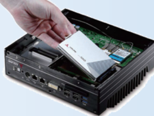
2. One screw removable storage bracket