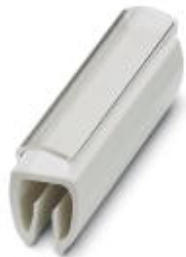
Conductor marker carrier, transparent, Unlabeled, Mounting type: Clip on, Cable diameter: 2-3.5 mm, Lettering field: 4 x 15 mm

Please be informed that the data shown in this PDF Document is generated from our Online Catalog. Please find the complete data in the user's documentation. Our General Terms of Use for Downloads are valid ( http://download.phoenixcontact.com )