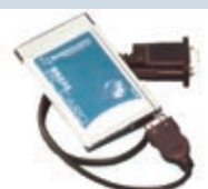
PM-020: PCMCIA 1xRS232 1MBaud