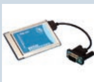
PM-143 PCMCIA 1xRS232 RUGGED 1MBaud