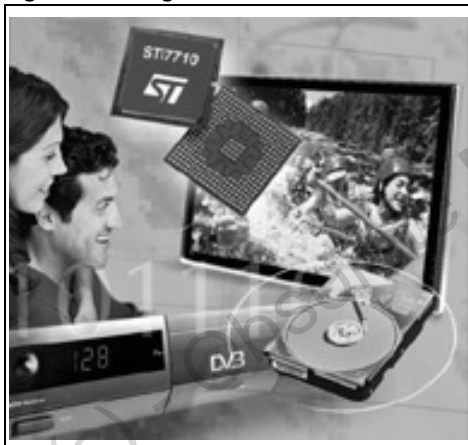
Figure 1. Package