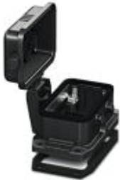
HEAVYCON EVO panel mounting base, plastic, B10, for double locking latch, height: 30.5 mm, with flat gasket, with protective cover

Please be informed that the data shown in this PDF Document is generated from our Online Catalog. Please find the complete data in the user's documentation. Our General Terms of Use for Downloads are valid ( http://download.phoenixcontact.com )