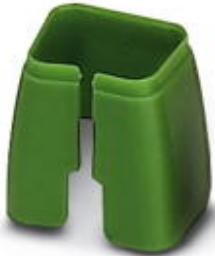
Color marking for patch cable, green

Please be informed that the data shown in this PDF Document is generated from our Online Catalog. Please find the complete data in the user's documentation. Our General Terms of Use for Downloads are valid ( http://phoenixcontact.com/download )