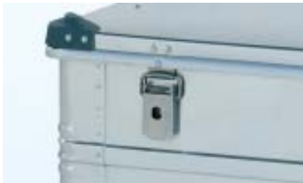
Corner Locators and Hasp