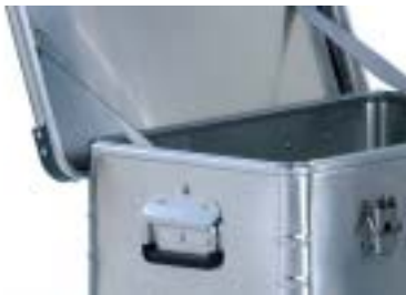
Lid restraint straps and handles