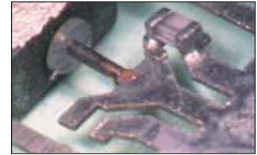
Anode, fuse and leadframe assembly

TBW Fused Tantalum Capacitors offer protection from possible damaging short circuit failure modes. This is accomplished with an internal fuse in series with the capacitor. See the photograph on the right. The AVX fused tantalum offers lower ESR limits than competitive fused tantalum capacitors, and is available with Weibull and surge testing per MIL PRF 55365.