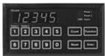
Cat. No. 58831400