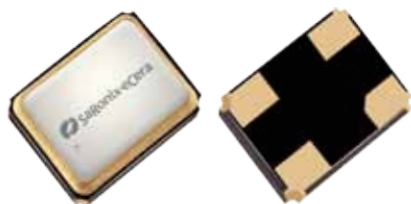
3.2 x 2.5mm Ceramic SMD