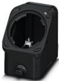
HEAVYCON EVO sleeve housing, plastic, with bayonet flange for EVO screw connection, B10, for single locking latch, height: 60.6 mm, without EVO screw connection

Please be informed that the data shown in this PDF Document is generated from our Online Catalog. Please find the complete data in the user's documentation. Our General Terms of Use for Downloads are valid ( http://download.phoenixcontact.com )