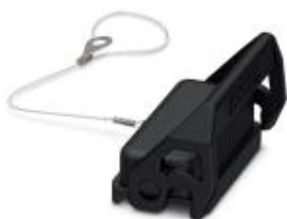
Protective cover D15, With single locking latch, protective cover material: PC, height: 19 mm

Please be informed that the data shown in this PDF Document is generated from our Online Catalog. Please find the complete data in the user's documentation. Our General Terms of Use for Downloads are valid ( http://phoenixcontact.com/download )