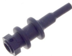
Rubber grommet for miniature connectors