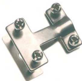
Cable clamp for miniature connectors