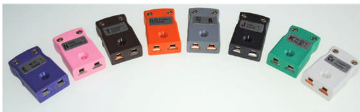
'IEC Colour Coded'