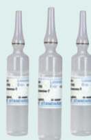
3 (20mL) ampules of Chlorine Standard