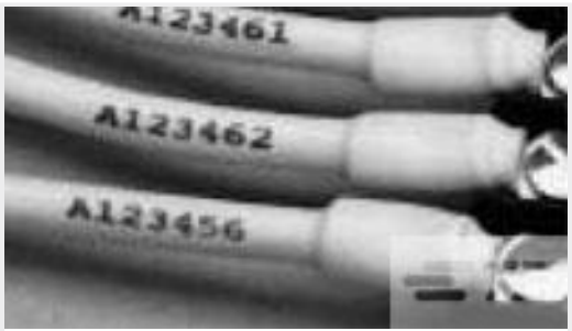
TE Part #5053034048 RNF-100-1/8-9-SP