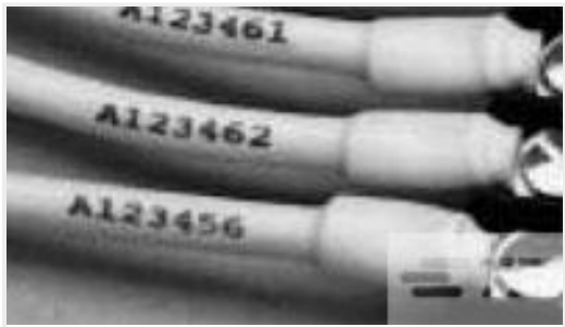
TE Part #5052984035 RNF-100-3/32-9-SP