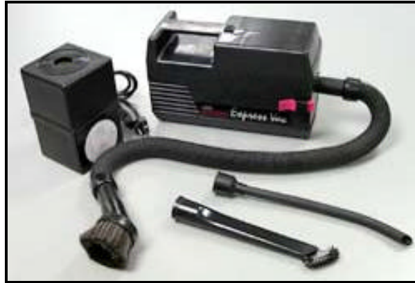
EXPRESS CARTRIDGE VACUUM

Uses include very fine dust, color toner, fumes, allergens, chemical spills, mold spores, and other ultra fine particulate.