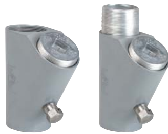
EYD EYD with Nipple (Drain/Seal for vertical conduit)

EY & EYD Series Class I, Div. 1 & 2, Groups C,D Class I, Zone 1, Groups IIB, IIA Class II, Div. 1 & 2, Groups E,F,G Class III