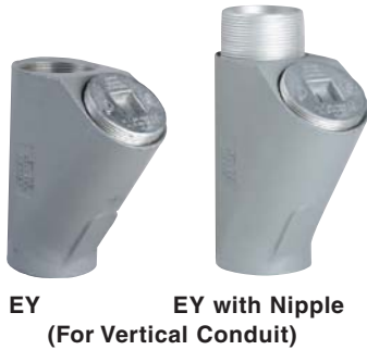
EY EY with Nipple (For Vertical Conduit)