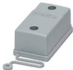
VARIOCON protective cover for sleeve housing, with IP50 protection, type 2, max. tightening torque: 1.6 Nm

Please be informed that the data shown in this PDF Document is generated from our Online Catalog. Please find the complete data in the user's documentation. Our General Terms of Use for Downloads are valid ( http://phoenixcontact.com/download )