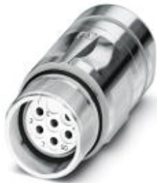
Coupling connector, straight, shielded: yes, SPEEDCON locking, M23, Number of positions: 6, Type of contact: Socket, Crimp connection, Cable diameter: 3 mm ... 14.5 mm

Please be informed that the data shown in this PDF Document is generated from our Online Catalog. Please find the complete data in the user's documentation. Our General Terms of Use for Downloads are valid ( http://phoenixcontact.com/download )