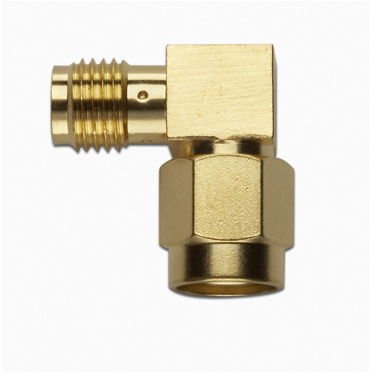
Model 72965 SMA R/A PLUG TO JACK

High bandwidth, small size, and durability for confident connections.