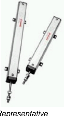
Representative photograph, actual product appearance may vary.

Due to regional agency approval requirements, some products may not be available in your area. Please contact your regional Honeywell office regarding your product of choice.