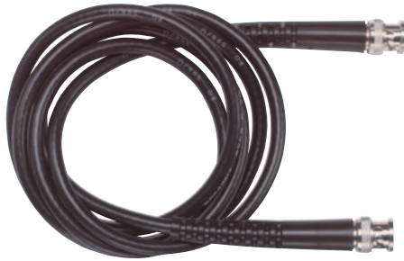
Rugged 75Ω BNC Plug / Plug, 6ft to 25ft (1.8m to 7.6m) 2249-E