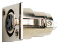
XLR (F) Panel Receptacle, 3 Contacts, Nickel-plated Zinc 5113A