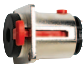
Panel Mount 1/4 Phone Jack, Locking 6877