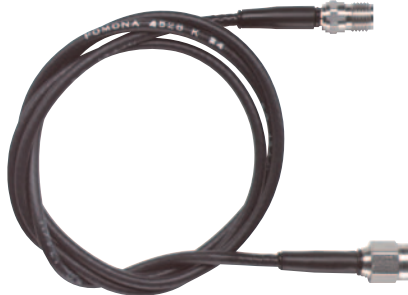
SMA (M) / SMZA(F) 50Ω Cable Assembly, 48in (1.2m) 4528