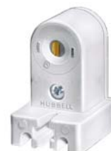
HLB2989 Low Voltage End