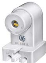
HBL2988 High Voltage End