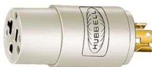
HBL2274 Slot End Female Blade End Male