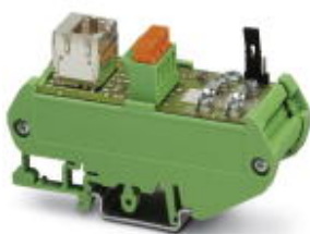
Patch panel for PROFINET, RJ45, DIN rail mounting, IP20, 3 slots, IDC connection, CAT5e, option of shielding via jumpers

Please be informed that the data shown in this PDF Document is generated from our Online Catalog. Please find the complete data in the user's documentation. Our General Terms of Use for Downloads are valid ( http://phoenixcontact.com/download )