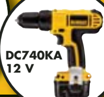
DC740KA 12 V