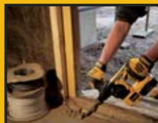
DC213KL 3 MODE SDS HAMMER