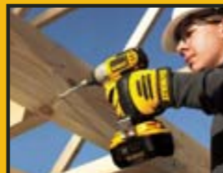
DC827KL IMPACT DRIVER