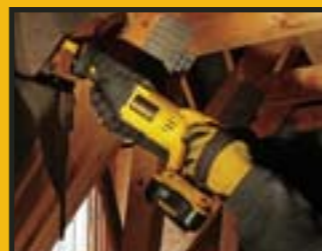
DC385KL RECIP SAW