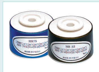
RH300-CAL Optional calibration salt bottles