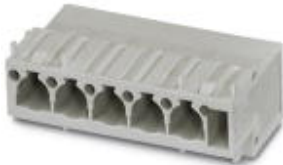
The figure shows the product version VC-AML 5

Mounting contact insert with PCB connection, type: 3, Number of pos.: 4+PE