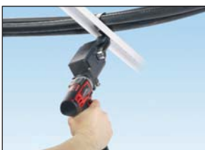
360° Rotating Head