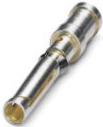
Turned 1.6 crimp contact, individual female contact, core diameter 1.5 mm 2 , silver-plated

Please be informed that the data shown in this PDF Document is generated from our Online Catalog. Please find the complete data in the user's documentation. Our General Terms of Use for Downloads are valid ( http://phoenixcontact.com/download )