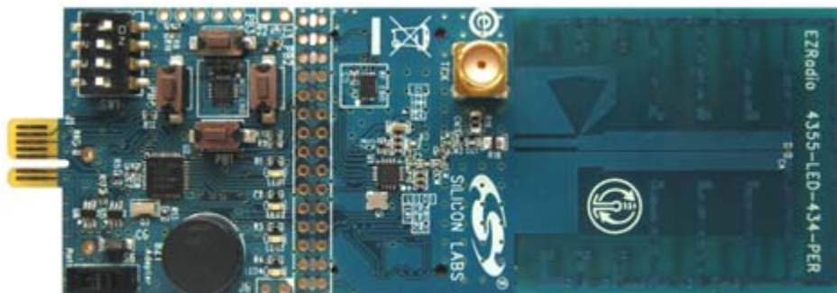
Figure 4. Si4355 RFStick 434 MHz Receiver Board (P/N 4355-LED-434-SRX)

Note: Instead of this board, the 434 MHz development kits may contain the pcb antenna version of this board called the Si4010 key fob development board 434 MHz (P/N 4010-DKPB_434).