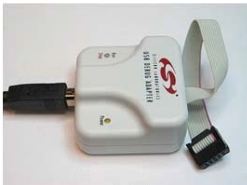
Figure 7. EC3 Debug Adapter (P/N EC3)