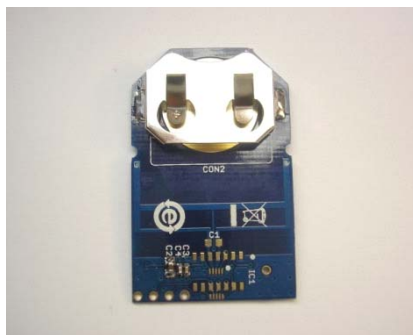
Figure 5. 4010 Key Fob Demo Board 434 MHz w/o IC (P/N 4010-KFOB-434-NF)