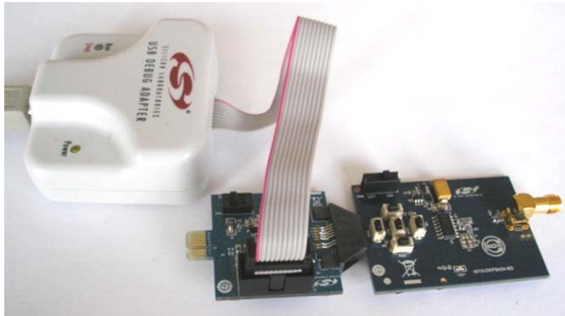
Figure 9. Target Board and Debug Adapter

The target board is connected to a PC running the Silicon Laboratories IDE via the USB Debug Adapter as shown in Figure 9.