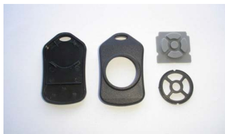
Figure 6. Key Fob Plastic Case (Translucent Grey) (P/N MSC-PLPB_1)