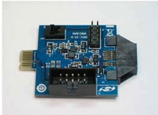
Figure 1. Burning Adapter Board (P/N MSC-BA4)