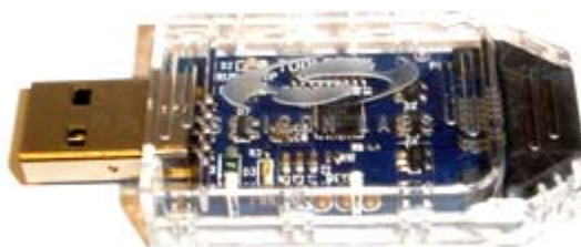
Figure 8. Toolstick Base Adapter (P/N Toolstick_BA)