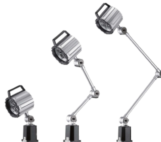
777-7978 EU PLUG 777-7987 EU PLUG 777-7980 EU PLUG 777-8016 UK PLUG 777-8025 UK PLUG 777-8028 UK PLUG

Equipped with a LED driver for directly connecting to voltage of AC power. (100V~260V) (50Hz/60Hz) with plug. (For high voltage)