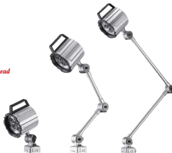
777-7962 NO PLUG 777-77971 NO PLUG 777-7974 NO PLUG

Low voltage power AC24V or DC24V is available. Also, special voltage can be specified.