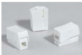
Quick installation and release of lighting devices with HelaCon Lux