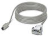
Connecting cable, for connecting the controller to a PC (RS-232) for PC WORX with flow control, 3 m in length

Connecting cable - COM CAB MINI DIN - 2400127