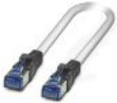
Patch cable, CAT6, pre-assembled, 2.0 m

Patch cable - FL CAT6 PATCH 2,0 - 2891589