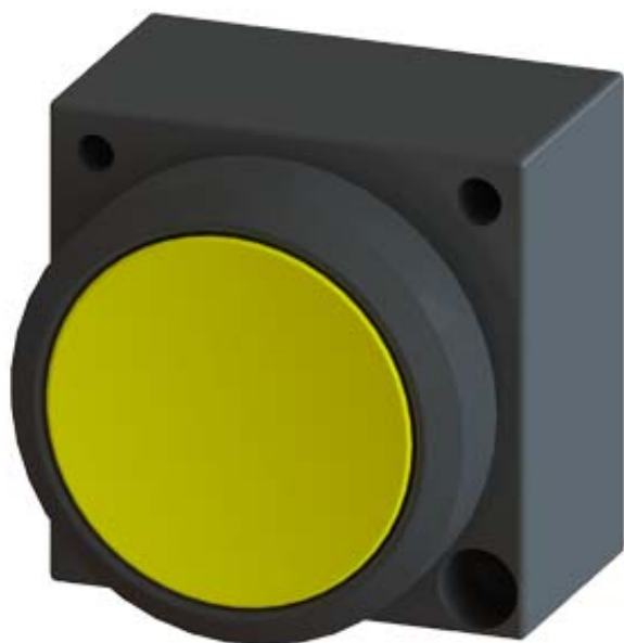
22MM PLASTIC ROUND ACTUATOR: PUSHBUTTON WITH FLAT BUTTON WITH HOLDER YELLOW