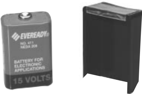
Model. No. 45002