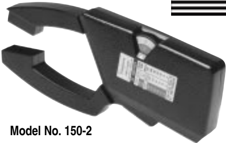
Model No. 150-2

Amp-Clamp current probes, used with analog VOMS provide accurate measurements of high AC current found in power systems and related control circuitry. The Amp-Clamp jaws are closed over a conductor in the circuit and the current load is indicated on the connected meter. The 150-2 has six ranges (up to 300 ACA) and is available with banana and reverse banana plugs.