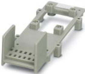
Plug receptacle, for plug assembly board, with strain relief, for accommodating contact inserts, type HC-B 6

Please be informed that the data shown in this PDF Document is generated from our Online Catalog. Please find the complete data in the user's documentation. Our General Terms of Use for Downloads are valid ( http://download.phoenixcontact.com )